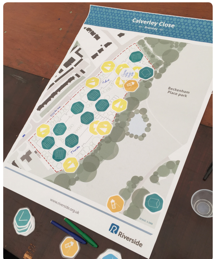
Example of one groups outcome in 'mapping' workshop