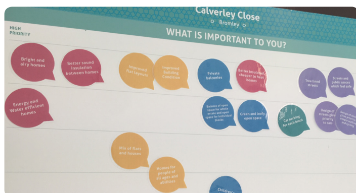
Example of one groups outcome in 'prioritisation' workshop