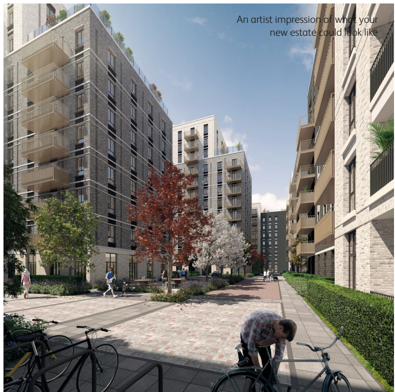
An artist impression of what your new estate could look like

They had also rejected our proposal to gate the new development, all of which had caused a delay in meeting with the planning committee to seek approval.