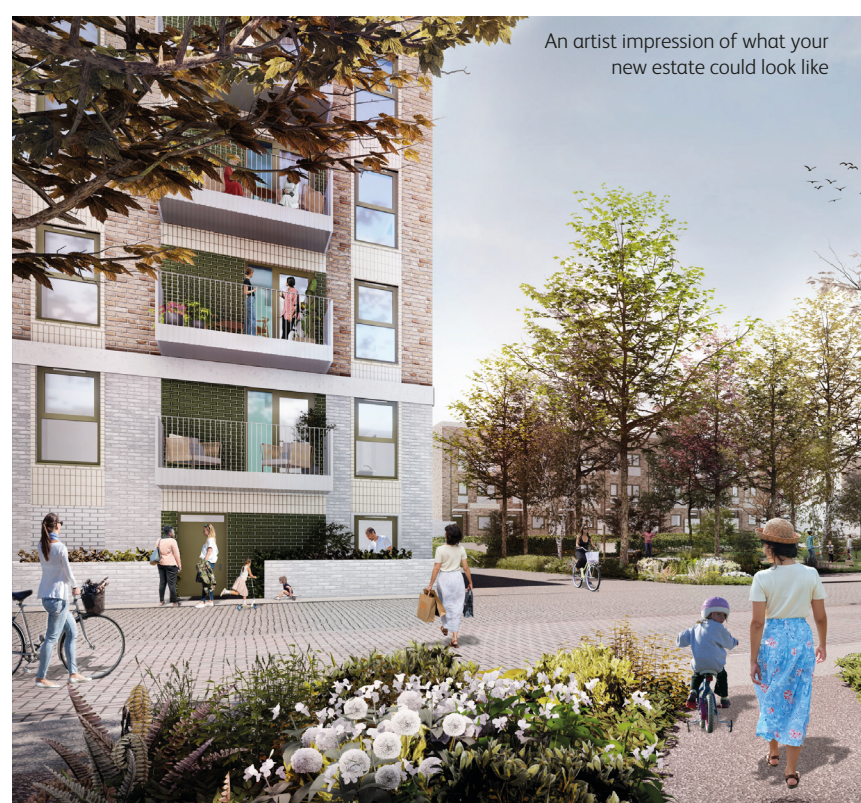
An artist impression of what your new estate could look like

The proposals include a guarantee that all existing residents will be offered a new home on the estate to meet their housing needs.