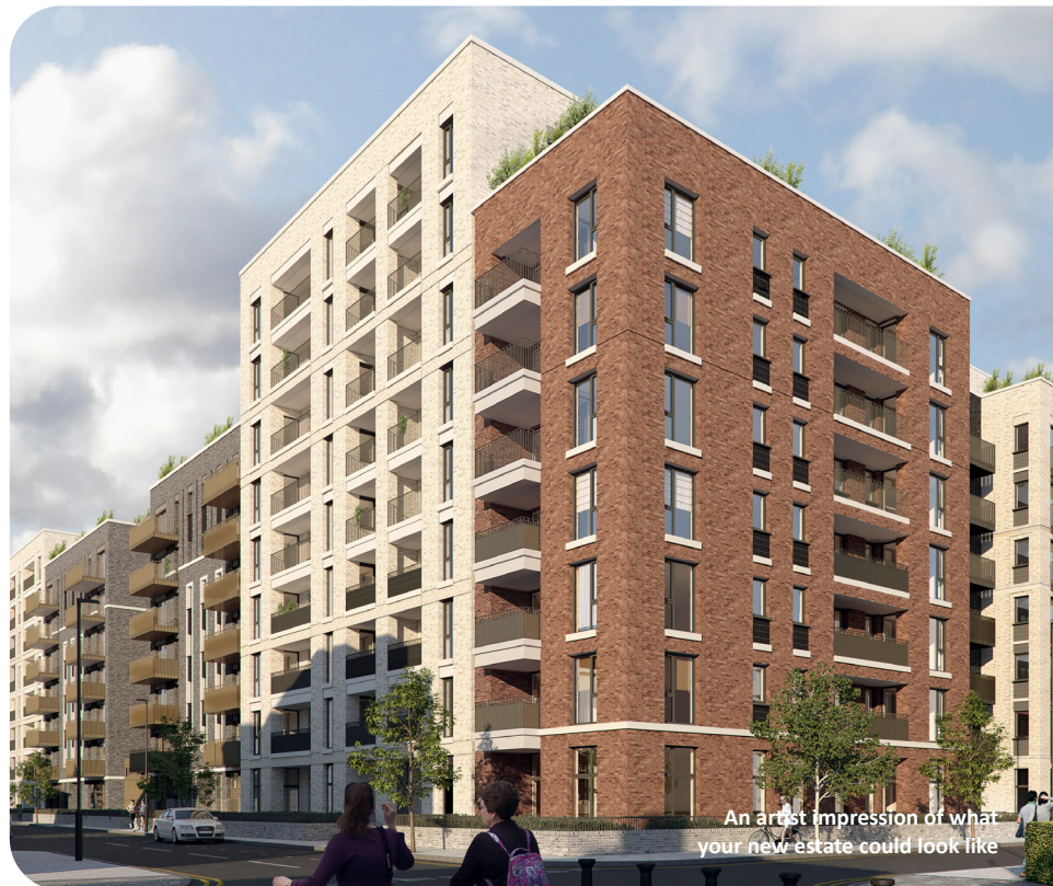
An artist impression of what your new estate could look like