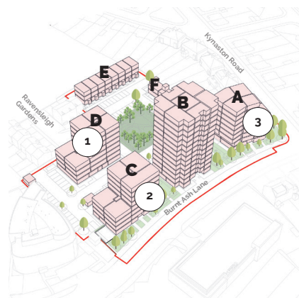
Phase 4: Build terraced housing, construct central square