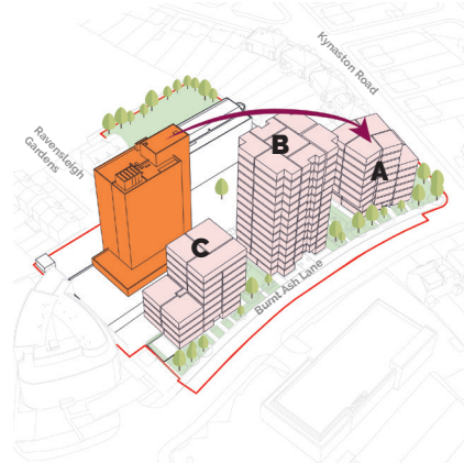
Phase 2: Demolish Mede and Wells, Build Blocks A and B. Decant remaining Burnt Ash Heights to Block A.