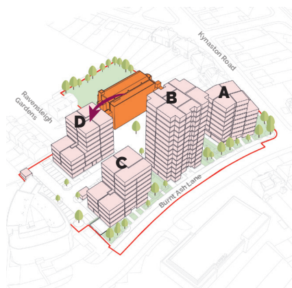
Phase 3: Demolish Burnt Ash Heights and Build Block E. Decant Lavisham.