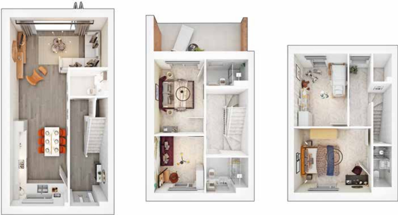
Computer generated image is indicative only.