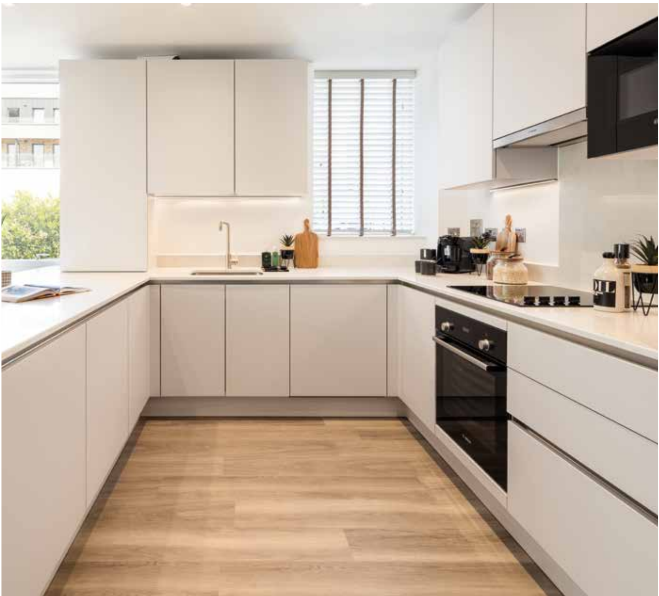
Image of show home interior at Granville Gardens