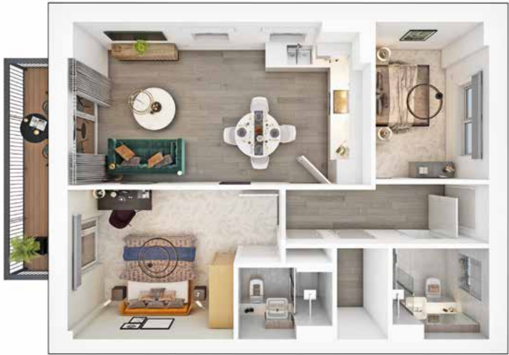
Computer generated image is indicative only.