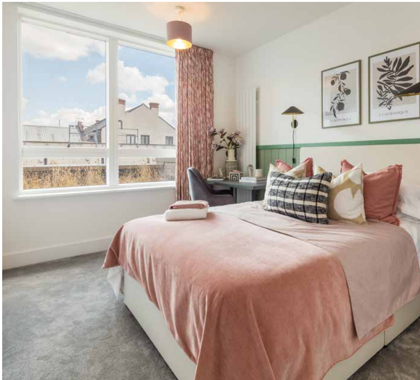
Image of show home interior at Granville Gardens.