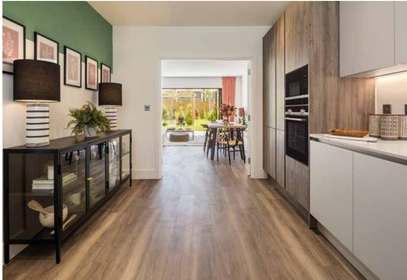
Image of show home interior at Granville Gardens