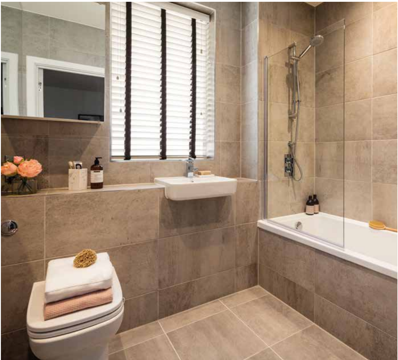
Image of show home interior at Granville Gardens.