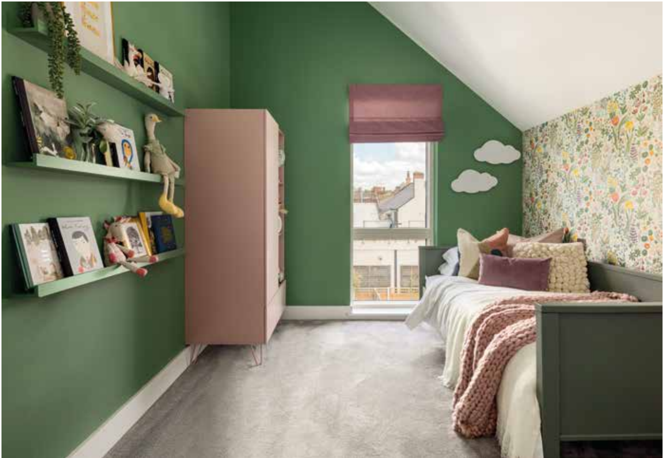
Image of show home interior at Granville Gardens.