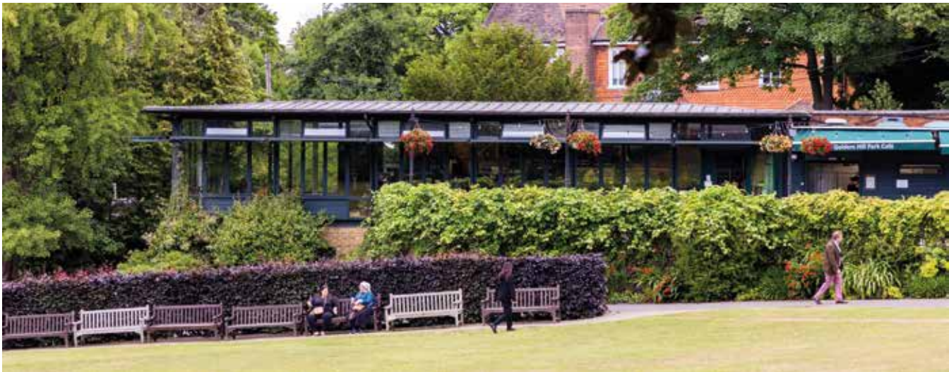
Golders Hill Park offers so much. Including ornamental gardens, a remarkable stumpery of woodland, bandstand, croquet lawn, beautiful walled garden, café, playground and even a free zoo.