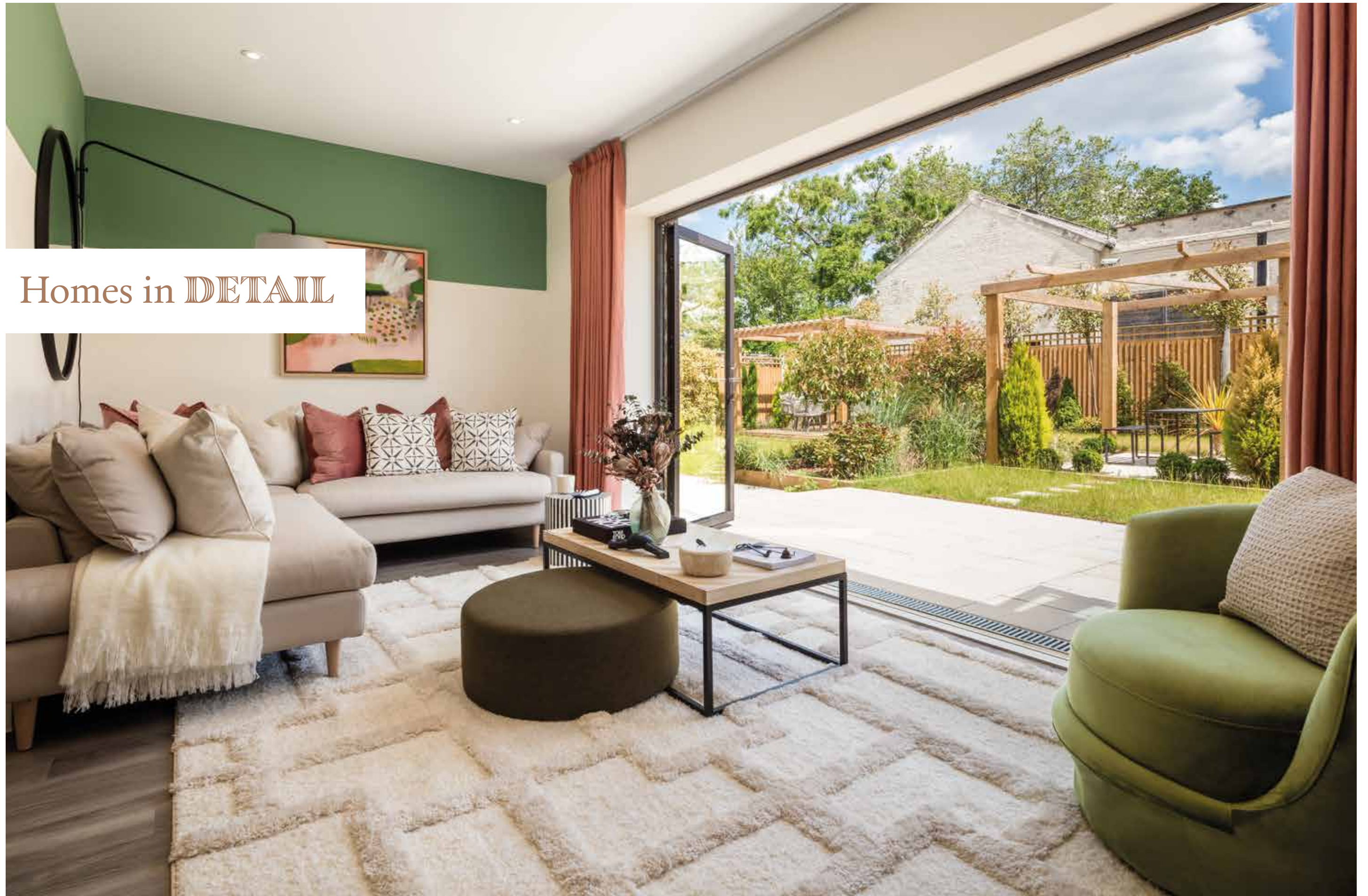
Image of show home interior at Granville Gardens.