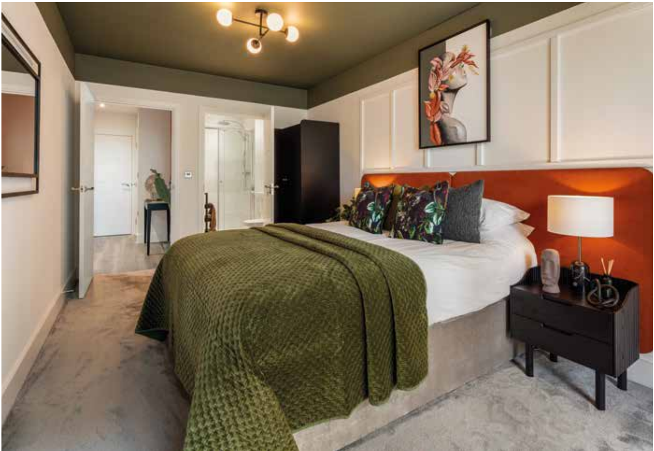
Image of show home interior at Granville Gardens