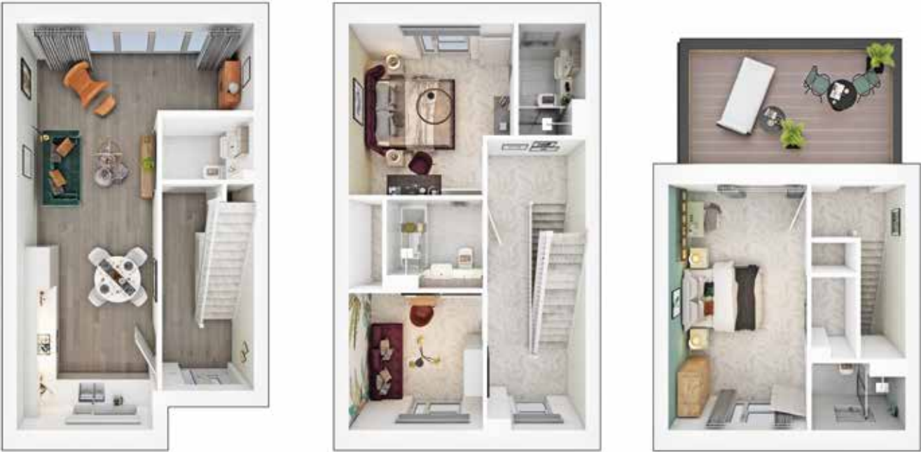
Computer generated image is indicative only.