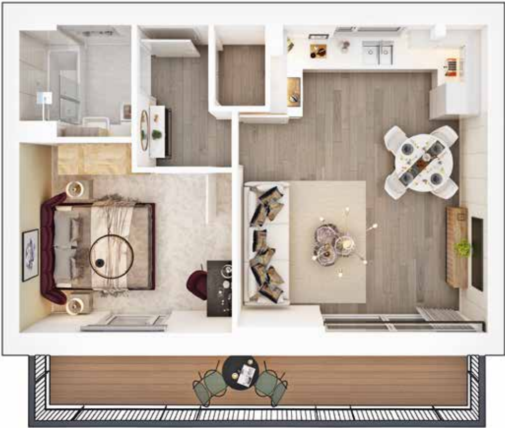
Computer generated image is indicative only.