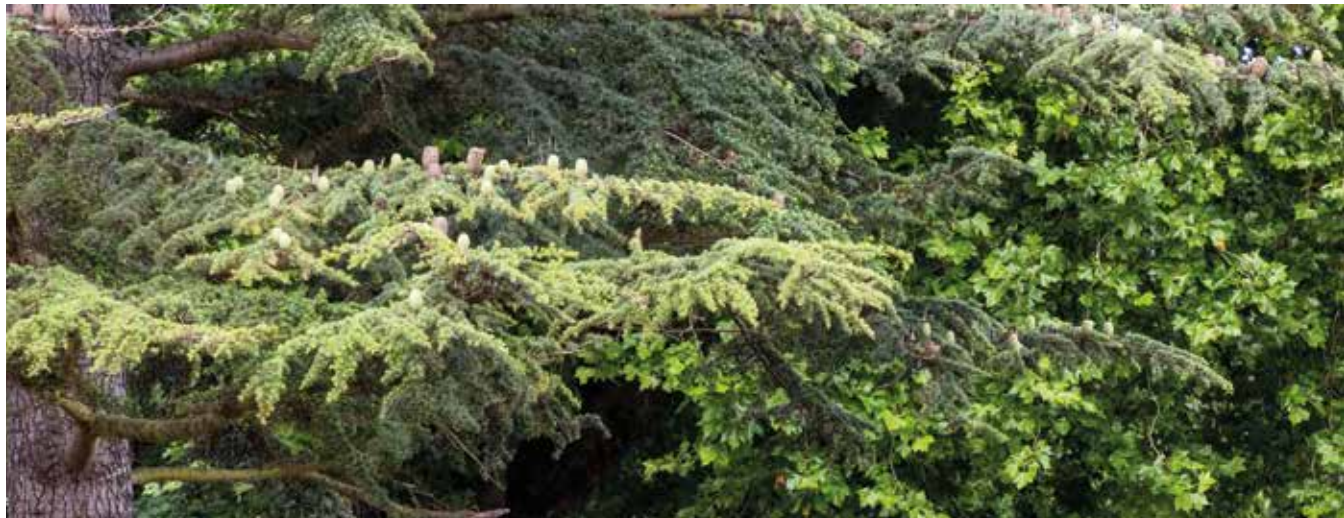
Granville Gardens has Childs Hill Park and Basing Hill Park within just a couple of minutes' walk. Head a little further and you reach Golders Hill Park. With its delightful pergola and extensive landscaping, this is a great place to visit any time of year.