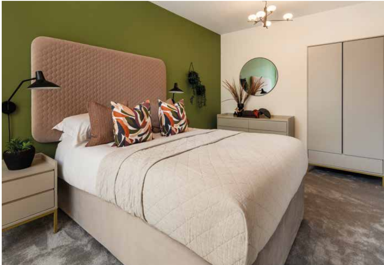
Image of show home interior at Granville Gardens